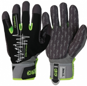
Vibration-reducing work gloves EX®