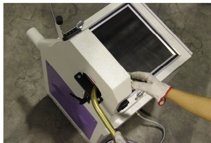
Finishing curved tubes with tight radii