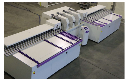
Automatic loading/unloading systems available on request