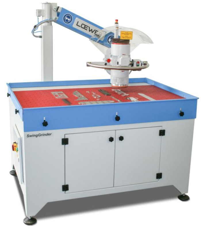
Open space for feet

Well-balanced swinging arm with weight compensation for effortless movement