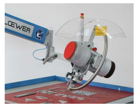
180° tiltable head for quick access to deburring and edge rouding tools