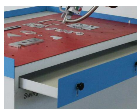
Pull-out dust collection container