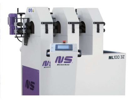
ML100 3Z – 3-station planetary finishing machine