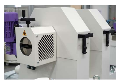
Automatic feeding with photocell sensors for automatic belts opening