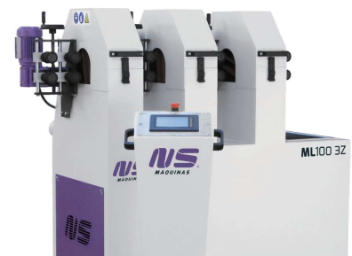
ML100 3Z – 3-station planetary finishing machine