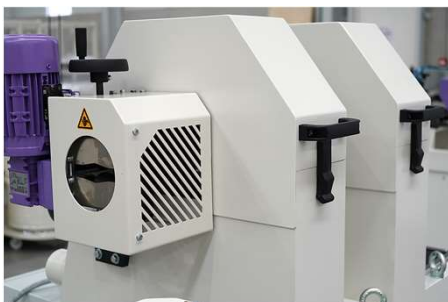
Automatic feeding with photocell sensors for automatic belts opening