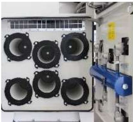
AS400 – 6-cartridge design

The AS200 has 2 ducts: the 1st is continuously connected to the machine to extract the dust during the grinding process, while the 2nd one is connected to a hose for the operator to use at the end of every shift to manually clean the areas where dust has accumulated.