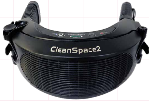
CLEANSAPCE2 PAPR PAF-0034