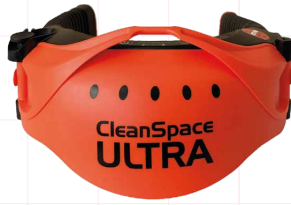
CLEANSAPCE ULTRA PAPR PAF-0070