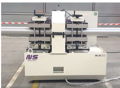
Optimized for large diameters and long tubes with minimal vibration