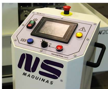
Touchscreen on mobile, independent unit (OPTIONAL)