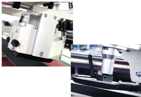
Interchangeable contact roller and flat grinding tool