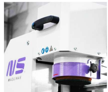
Flexible deburring and edge rounding station