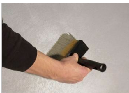
Step 5 - After several minutes, caress the product with a dry brush if you want to uniform the drawing