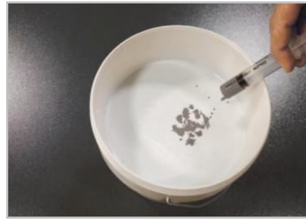
Step 2 - If necessary, prepare the shade with Minimal