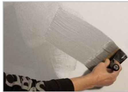
Step 4 - Freely distribute the product