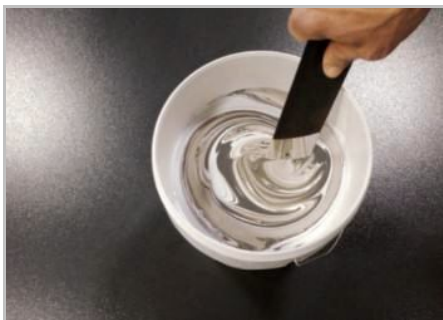
Step 3 - Mix the product until it's homogeneous