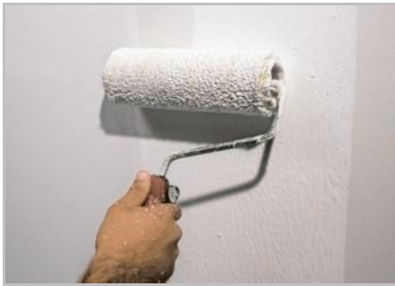
Step 1 - To start, apply Primus Sabbia

Conservation: in a dry, cool place, away from the frost and humidity.