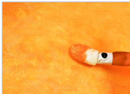
Step 6 - Second coat, optional if you want an 'aging effect' to the wall, pass again after 15-30 minutes with the glove dampened with the product