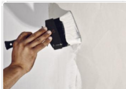
Step 4 - First coat