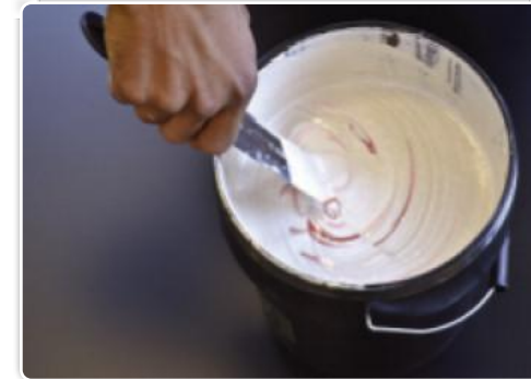
Step 3 - Mix the product until it's homogeneous.