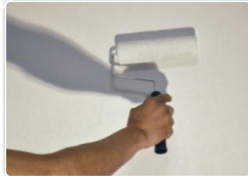
Step 1 - Start applying Primus Sabbia.

Fully washable with not aggressive soaps. Totally dry after 6 to 8 hours. Conservation: in a dry, cool place, away from the frost and humidity.