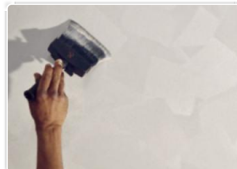
Step 5 - Second coat