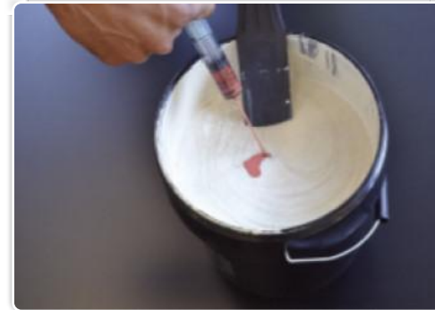
Step 2 - If necessary, prepare the shade with Gioia.