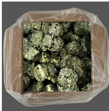
#AV-OB-DO-FS OATMEAL BLUEBERRY!