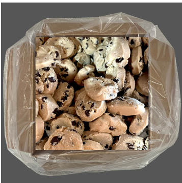
#AV-CC-DO-FS TRIPLE CHOCOLATE CHIP!