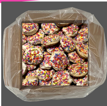
#AB-SC-DO-FS SPRINKLE CRUNCH!