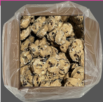
#AB-TCC-DO-FS TRIPLE CHOCOLATE CHIP!

SHELF LIFE: Frozen - 1 year Baked - 5 days