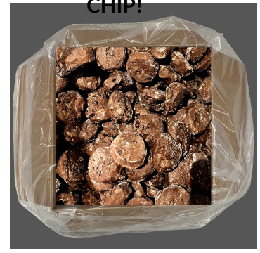
#AB-DCC-DO-FS DOUBLE CHOCOLATE CHIP!