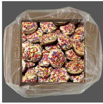
#AV-SC-DO-FS SPRINKLE CRUNCH!