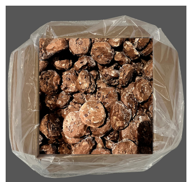
#AB-DCC-DO-FS DOUBLE CHOCOLATE CHIP!