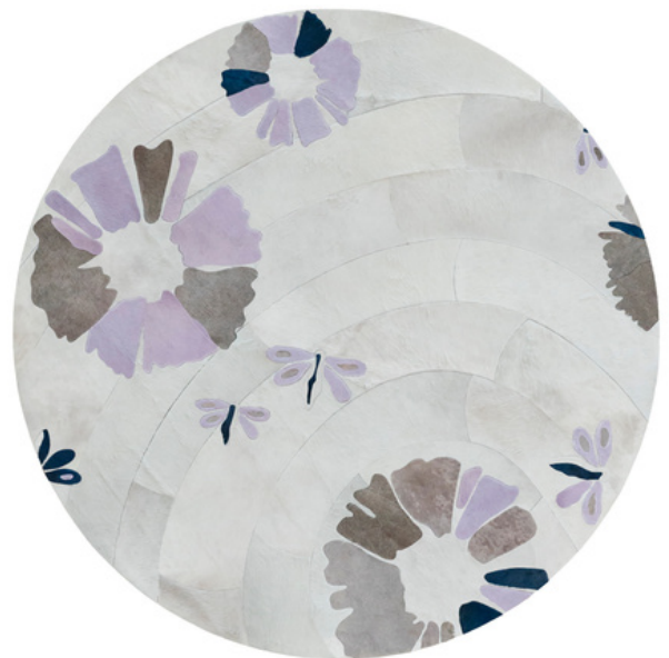
Shibori | Round