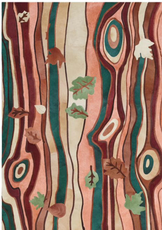
Dans Le Bois