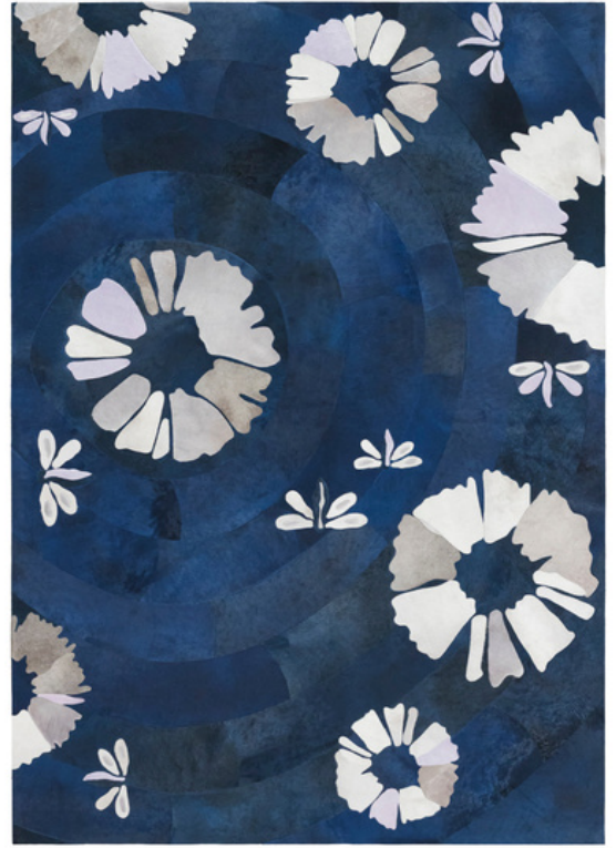
Shibori | Blue