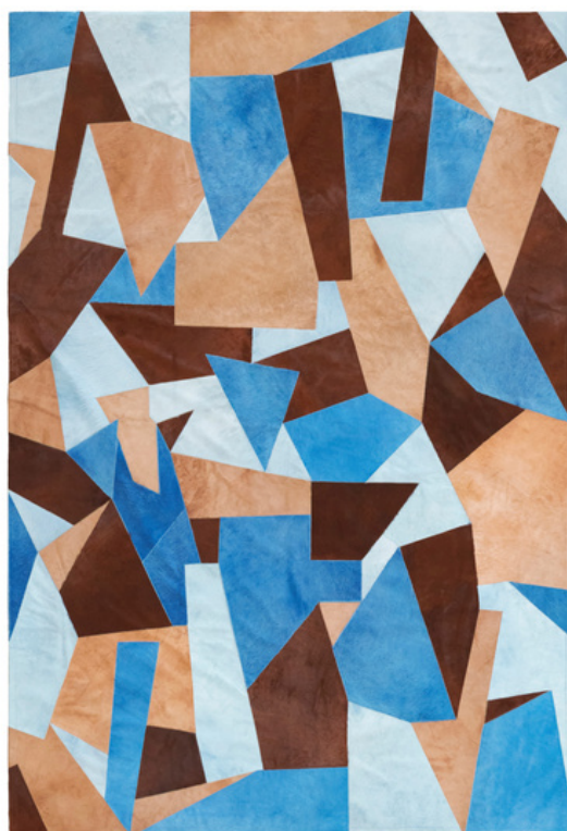
Fragments | Blue