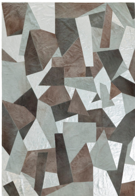
Fragments | Silver