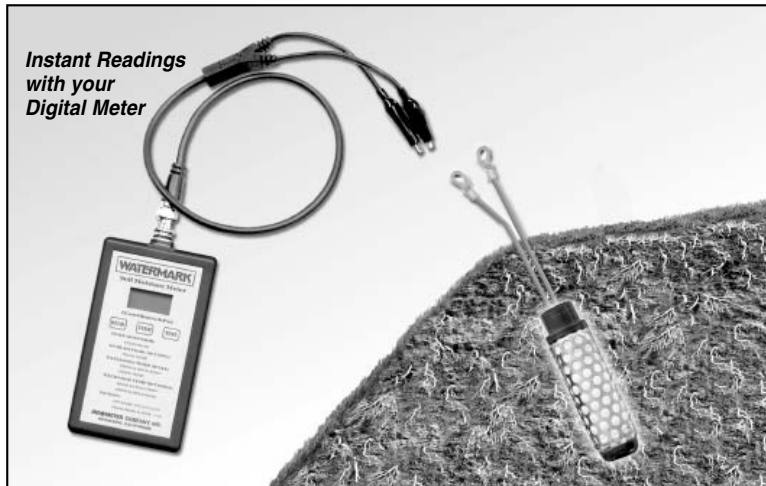
Charting of Readings shows WHEN and HOW MUCH to Irrigate