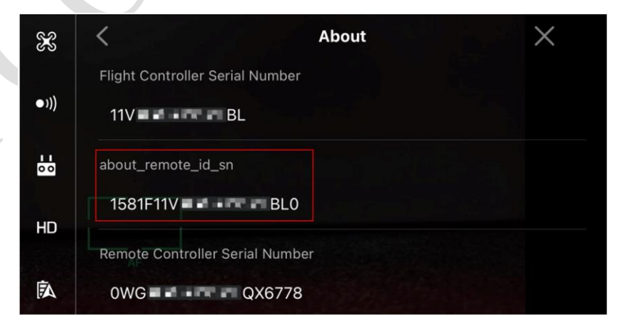
Phantom 4 Pro V2.0 (DJI GO 4)

The following figures show the Remote ID serial number on DJI GO 4, DJI Pilot, DJI GS RTK, DJI Fly and DJI Agras using DJI Phantom 4 Pro V2.0, Mavic 2 Pro, Phantom 4 RTK, Air 2S and T30 as examples respectively.