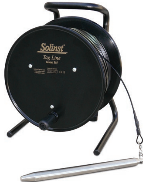
Tag Line / Suspension Cable