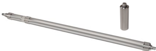
425-D Deep Sampling Discrete Interval Sampler and Weight