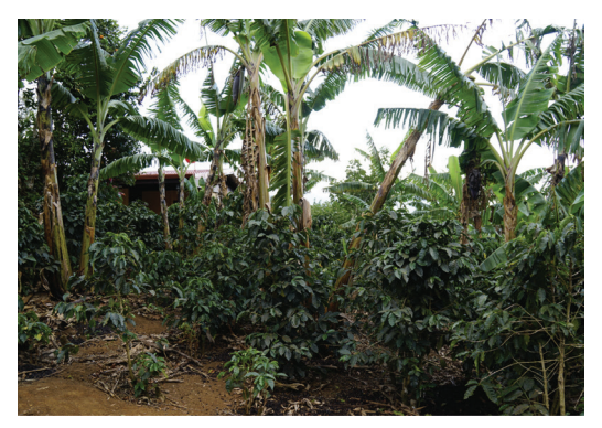
Coffee trees under a shade canopy