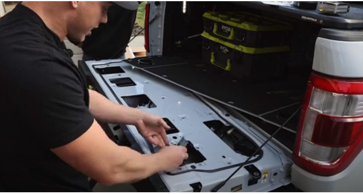
Note: for added sealing capabilities, pickup these sealing washers and place them under each bolt head, when reinstalling the tailgate panel. <a href="https://www.mcmaster.com/94733A719/">https://www.mcmaster.com/94733A719/</a>