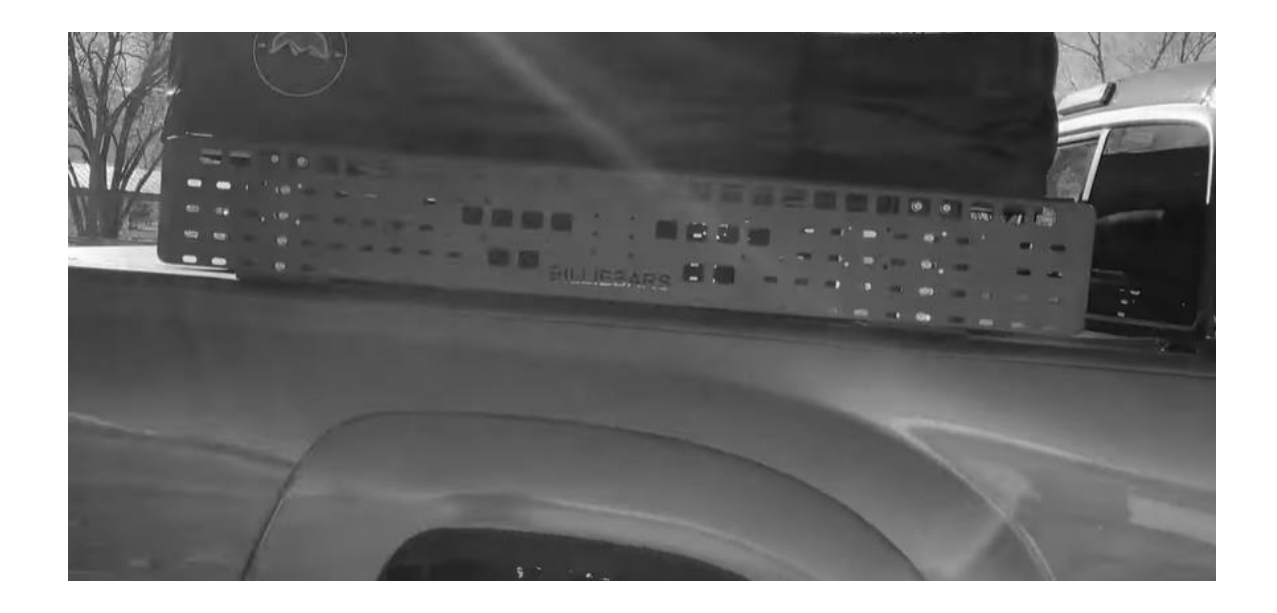
Tighten Screws to 15 ft*lbs using a 13mm wrench and T40 Bit. Periodically check tightness.

Note: A dab of anti-seize will help prevent galling of the threads. You may have to loosen your BillieBars Rack brackets to better align the mounting holes for the molle panels.