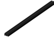
UPRIGHT BARS (X4)