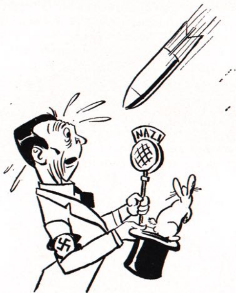
GOEBBELS' JOB GOT TOUGHER WHEN BOMBS BEGAN TO RAIN ON THE REICH

in the movies and magazines, is “propaganda”—propaganda that is self-seeking, deceitful, or otherwise improperly motivated. This is absurd.