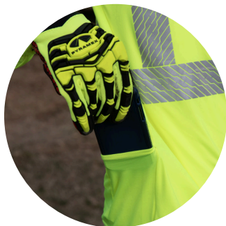
Cell phone pocket