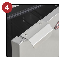
Magnetic Work Flow Handles