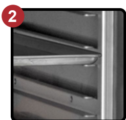
Unique Pan Slides