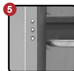
Field Reversible Door