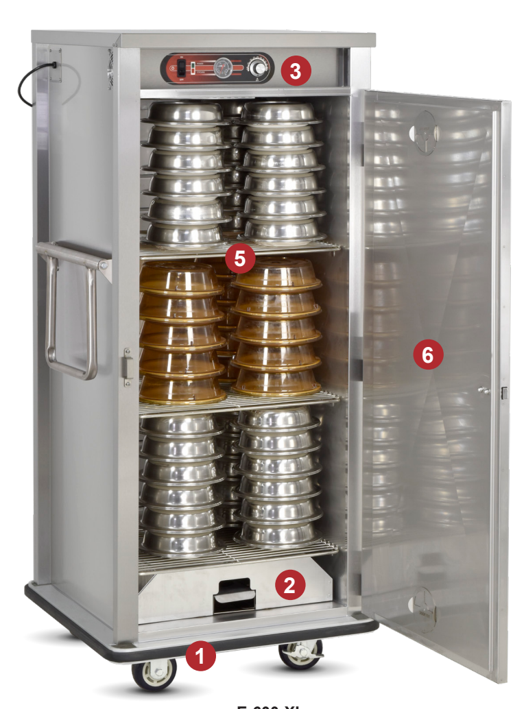
E-600-XL (Model shown with drop down handle optional accessory)

Sterno or electric heat banquet cabinets are built to handle your most challenging events, on site or off premises, and keep your meals hot and fresh in up to (180) 12.375" plates