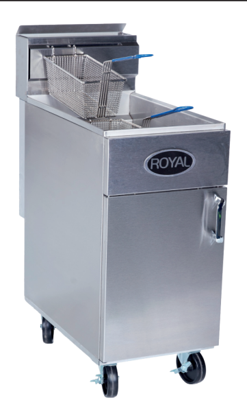
RFT-50 with optional casters