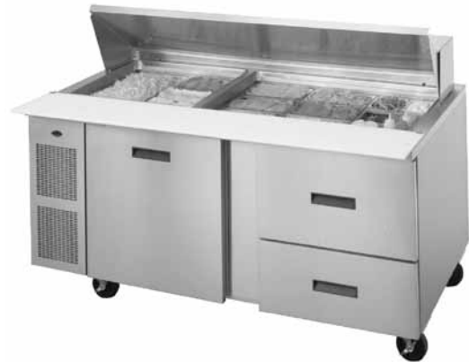
model 9045K-7 shown with optional refrigerated drawers

This equipment is intended for use in rooms having an ambient temperature of 86°F (30°C) or less.