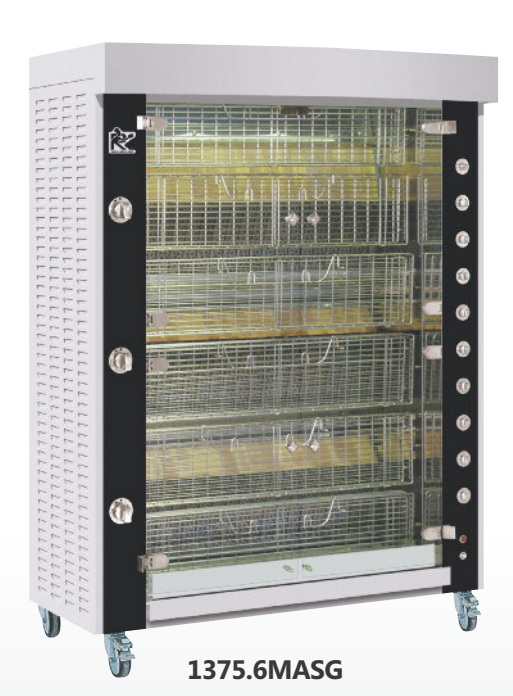
Stainless steel finish