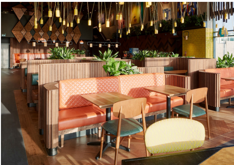
Nando's, Reading, United Kingdom