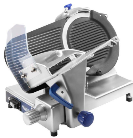
Heavy-Duty Electric Slicer