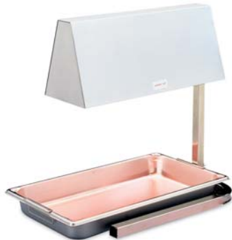
Cayenne® OHC-500 Heat Lamp