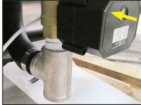
Fig. 1 - Dishwasher Drain Valve