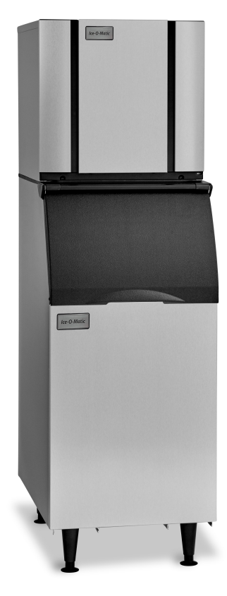
CIMO520 ON B42