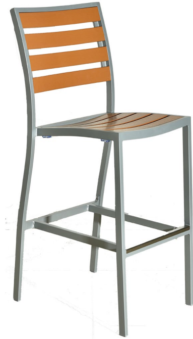
Silver / Teak 517B-PW-TS