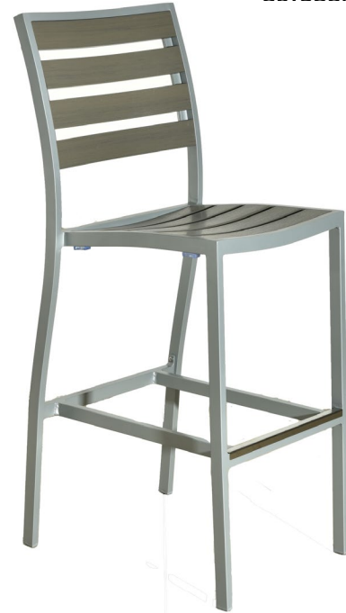
Silver / Grey 517B-PW-GS