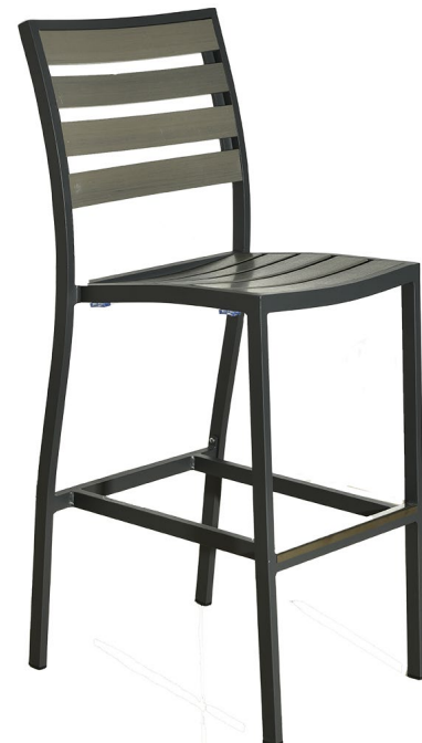
Antracite / Grey 517B-PW-GA