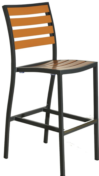
Antracite / Teak 517B-PW-TA