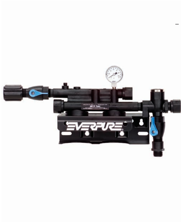
QC71 Twin Parallel Head: EV9272-22

Filter head exclusively for Everpure replacement cartridges