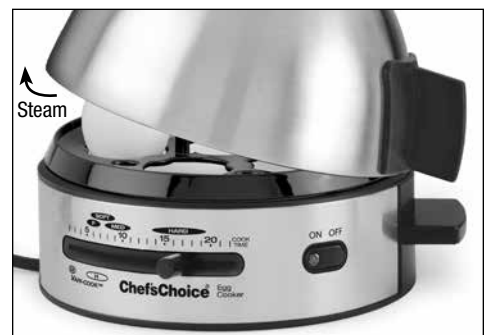
Figure 4. Remove the hot lid carefully by its handle. Tilt it as shown so that steam can escape from under the lid.