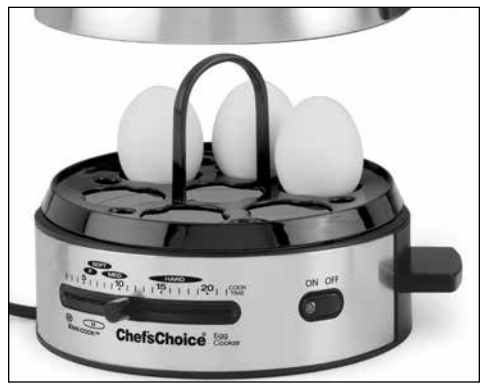
Figure 3. Insert the egg rack and cover with the lid.

MED or (HARD) according to your choice. Press "ON" the power switch on base unit and wait as the water boils and the eggs cook. A beeper will alert you when the eggs are done. At the sound of the beeper, turn the switch "OFF," which stops the beeper and stops the cooking. Remove the stainless lid, lift the tray of eggs and enjoy! As you remove the lid, use caution, the lid is hot and steam will rise from under the lid. Be careful to avoid the steam, which can scald you. Hold the lid, as shown in Figure 4, by the handle. Tilt the other end up as shown and remove it in such a way that you avoid coming into contact with the rising steam. Carefully take out the egg rack by its handle. Dip or rinse the eggs in cold water to stop the cooking, cool the shell and make them easier to handle.