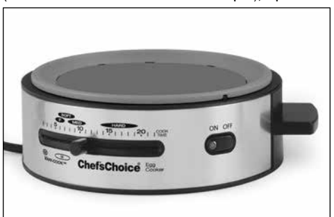
Figure 2. Fill the water pan no higher than the "LEVEL" fill Marks" with water. Do not overfill.

Place the Egg Cooker on a flat, level surface and remove the stainless lid and the egg rack from the base unit. Pour about 34 cup of water into the gray non-stick coated water pan to the "LEVEL" fill marks at top of the base (see fig. 1 and fig. 2). Do not add water above the fill marks. This amount of water is more than enough for cooking 7 eggs to your choice. Wash or rinse the eggs and load them onto the black egg rack. Place the rack of eggs on the base (see Fig. 3). (Make certain there is water in the water pan), replace the stainless lid and set the black slide control arm to SOFT).