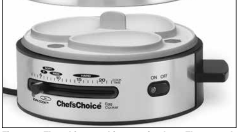
Figure 5. The white poaching tray in place. The control arm is set to "P".

If you want to sequentially cook medium boiled and then hard boiled eggs in the same batch, check the water level, load the eggs in the egg rack and cover with the stainless lid. Then position the slide control arm at MED on the UPPER time scale. Turn the power "ON". Wait as the eggs cook. When beeper sounds, stop the beeper by turning the power switch to "OFF"; remove the lid and the medium cooked eggs. Then replace the lid, move the slide control arm promptly to ⊕ on the lower Vari-Cook™ scale, turn "ON" the power and wait until the beeper sounds. Then turn "OFF" the power switch and beeper. Remove the hard boiled eggs. In these sequences it is necessary to turn the power switch "OFF" and "ON" as instructed to ensure accurate timing.