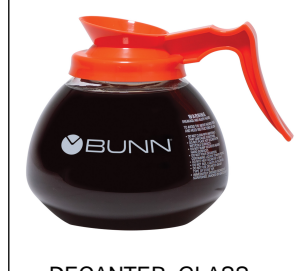
DECANTER, GLASS-ORN 12 CUP 1PK