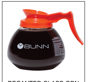
DECANTER,GLASS-ORN 12C 24/CS