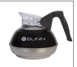
EASY POUR®,(BLK) 1/CS