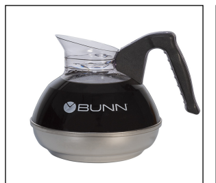
EASY POUR®,(BLK) 24/