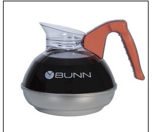
EASY POUR®,(ORN) 3/