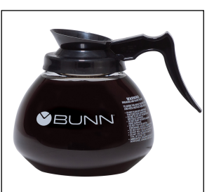
DECANTER,GLASS-BLK 12CUP 1PK