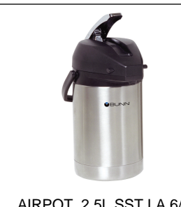
AIRPOT, 2.5L SST LA 6/ CASE