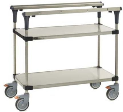
36" PrepMate shown with Solid Stainless Steel Shelves.

* Multi-Rails are capable of holding 800lbs evenly distributed on an 18"x24" work surface of sufficient strength centered in the unit.