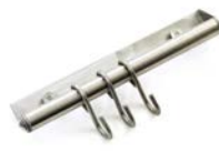
18" & 24" Utensil Bar