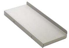
18" & 24" Work Surface Extension