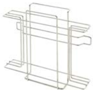
Cutting Board Holder