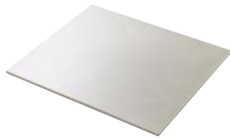
Stainless Work Surface