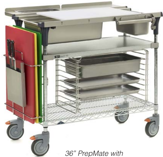
36" PrepMate with Optional Accessories