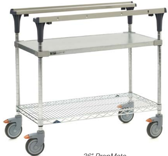
36" PrepMate Shown with Flat Galvanized Top Shelf and Wire Bottom Shelf.