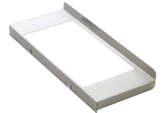
18" & 24" Drop-in Work Surface Extension