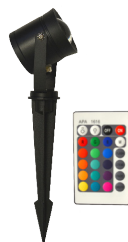
Blisslights Garden Accent Light 16-color user selctable