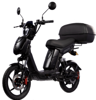
X-250 VOYAGER MAX