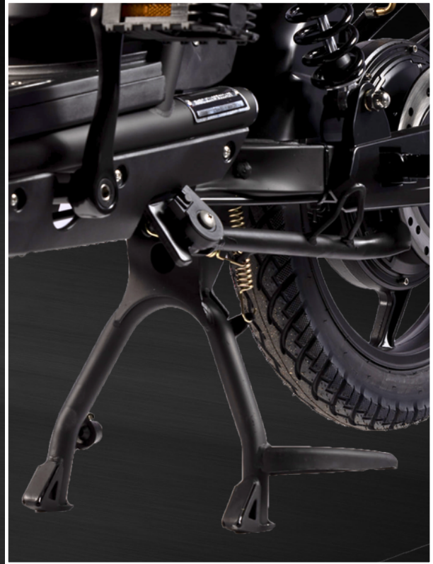
CENTER & SIDE STAND