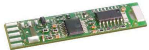
State-of-the-art Electronic Module