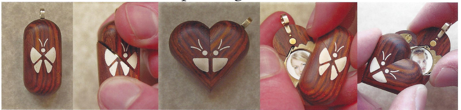
Twist to change form between an oval and a heart