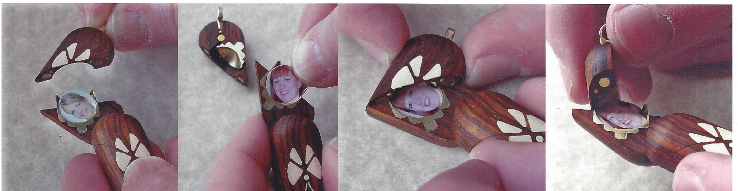
Remove old photo.