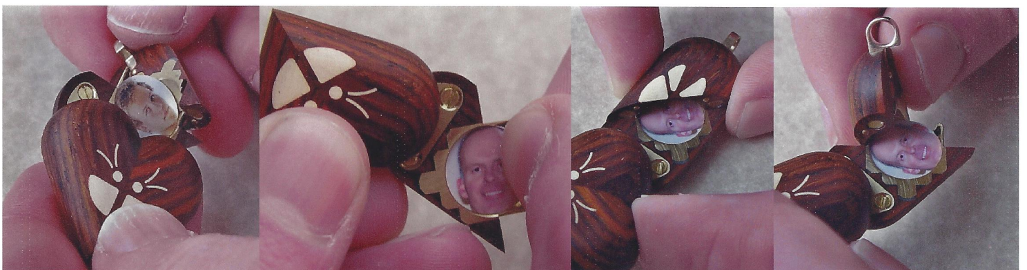
In heart shape rotate bail piece off and install your picture. Locate bail section as shown. Gently rotate piece into position.

Designed and manufactured in Eagle, Idaho by Illusion Locketts LLC. email: illusionlockets@q.com