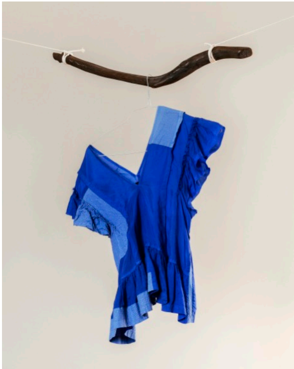
tricot Comme des Garçons Patchwork Top: Multiple tonal blue square panels of differing composition and treatment. Notched neckline, with ruched and gathered detailing at seams. 2007.