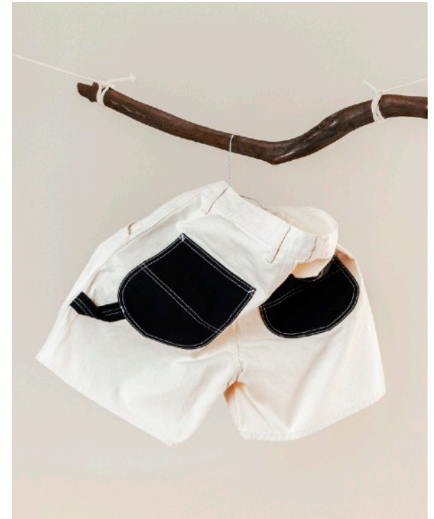
Ganryu Comme des Garçons Duck Canvas Shorts: Cream cotton duck canvas with snap button waist closure and raw hem tab detailing at waist. Five pocket build, triple stitched seams, contrast patch pockets at rear in black cotton textile with white contrast stitch and hammer loop detailing. 2014.