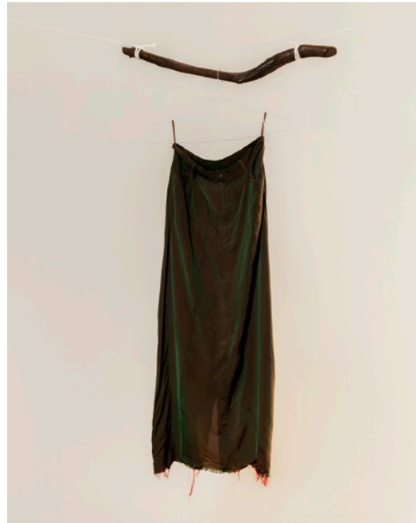
Comme des Garçons Iridescent Long Skirt: Long skirt in highly iridescent cupra textile that shimmers between maroon and olive green. Raw hem detail and five-pocket build, rear patch pockets with arcuate detailing akin to Levi's. 1992.