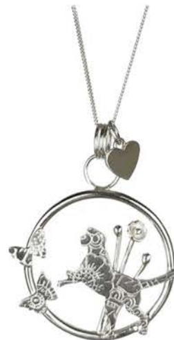
Sterling silver Chasing Butterflies pendant $165.00 AUD