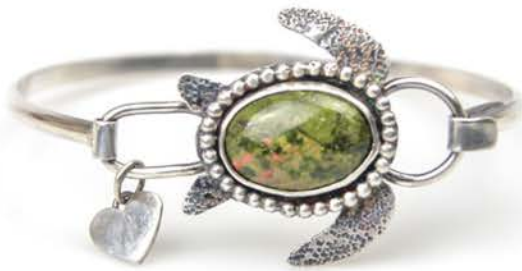
Sterling silver Turtle bangle $145.00 AUD