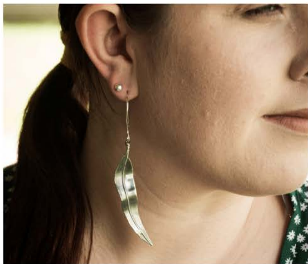
Sterling silver Eucalyptus Leaf earrings $100.00 AUD