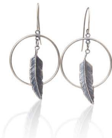
Fine silver Feather drop earrings $95.00 AUD