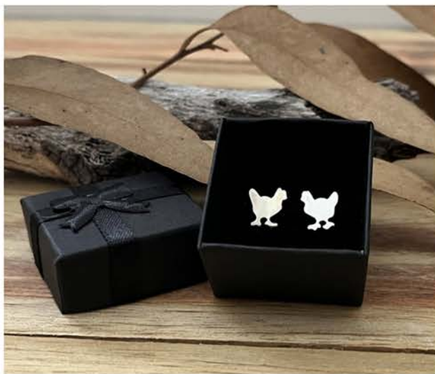
Sterling silver Chicken stud earrings $45.00 AUD