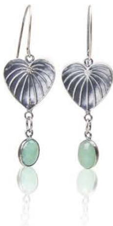
Fine silver Palm Leaf drop earrings $85.00 AUD