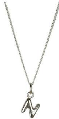
Fine silver Personalised Initial pendant $65.00 AUD