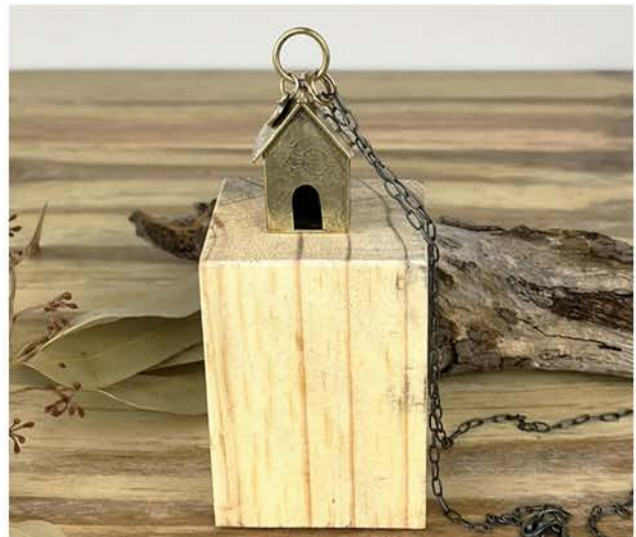
Brass Artisan Little House pendant $95.00 AUD