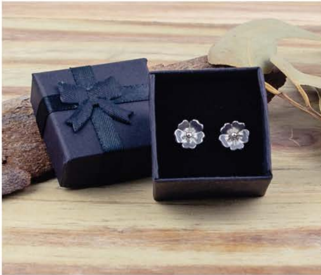
Sterling silver Forget-Me-Not stud earrings $75.00 AUD