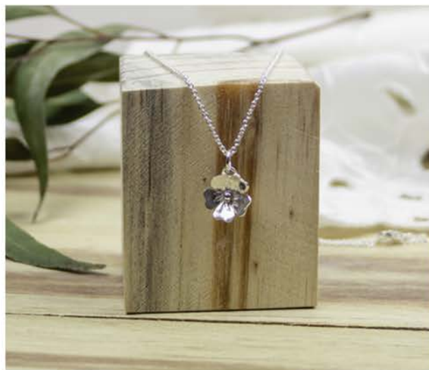
Sterling silver Forget-Me-Not pendant $85.00 AUD