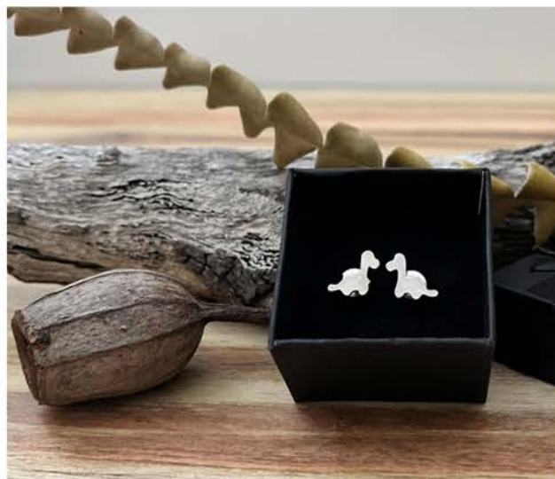
Sterling silver Brontosaurus stud earrings $45.00 AUD