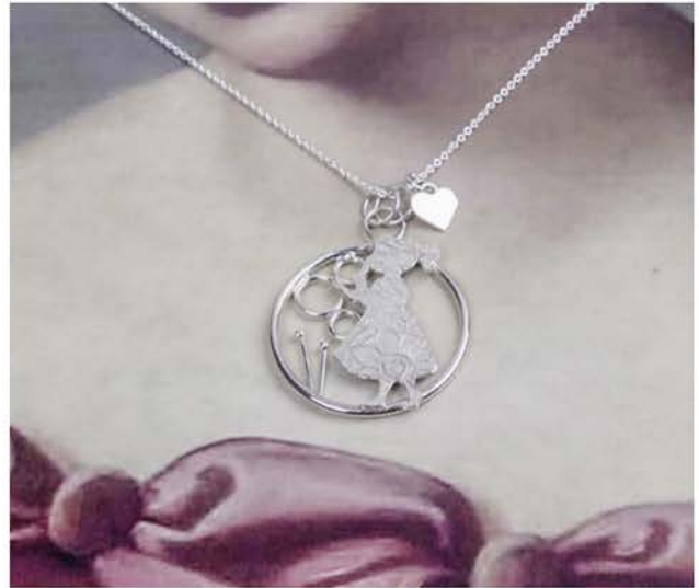
Sterling silver Blowing Bubbles pendant $165.00 AUD