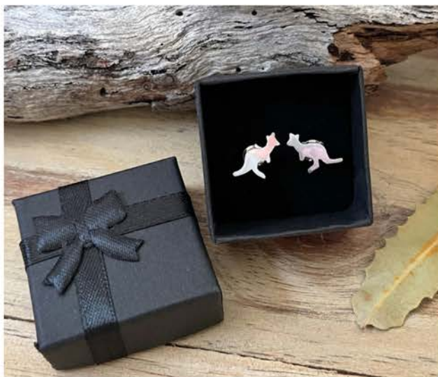
Sterling silver Kangaroo stud earrings $45.00 AUD