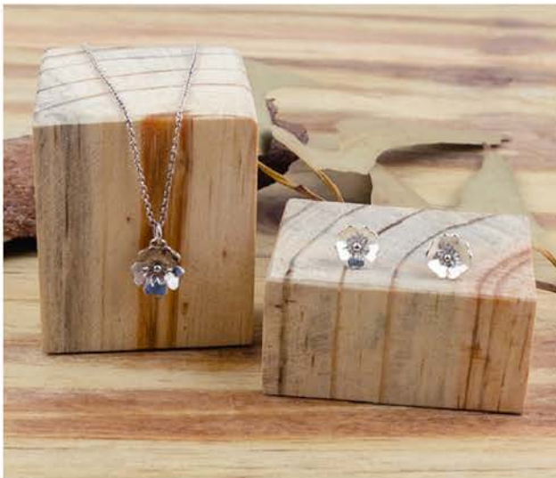
Sterling silver Forget-Me-Not set $145.00 AUD