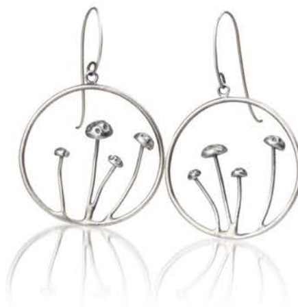
Fine silver Mushroom drop earrings $85.00 AUD