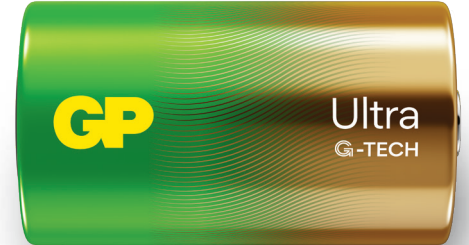
Model No.: GP13AU

This specification is applicable to GP Ultra Alkaline Cell, GP13AU (Mercury & Cadmium Free).