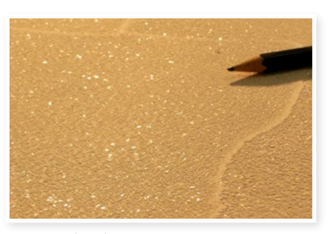
1% Muscovite Mica -fine- in Marble Fibre Render, tinted beige