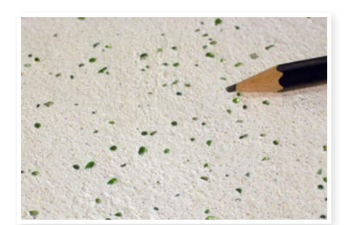
6% Glass Pebbles -light green- in Lime Wall Finish -medium