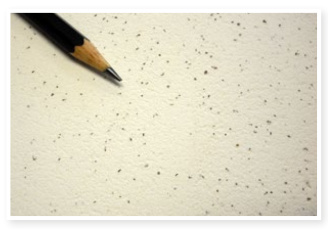
1% Walnut Shell Granules in Lime Wall Finish -smooth-