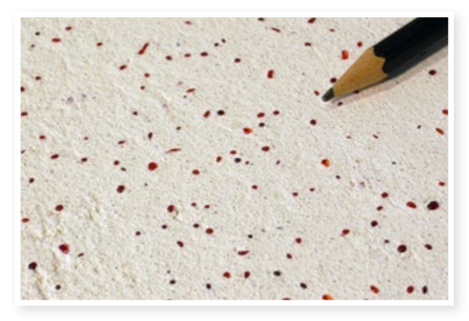
6% Glass Pebbles -ruby red- in Lime Wall Finish -medium