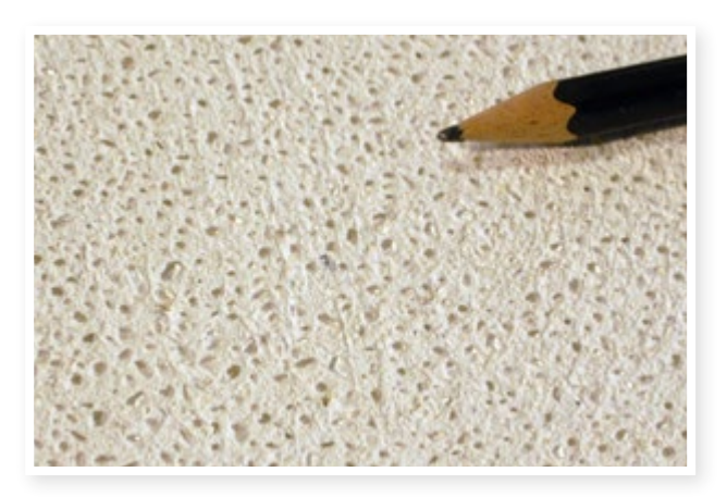
100% Glass Pebbles -clear- in Lime Wall Finish -medium