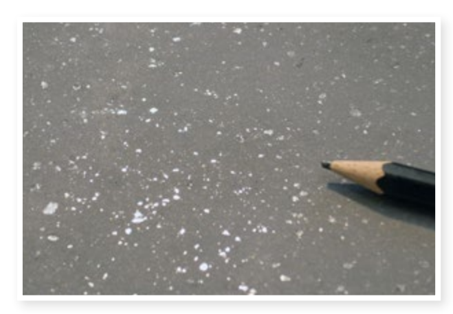
1% Muscovite Mica -corse- in Lime wall Finish -smooth-, tinted grey