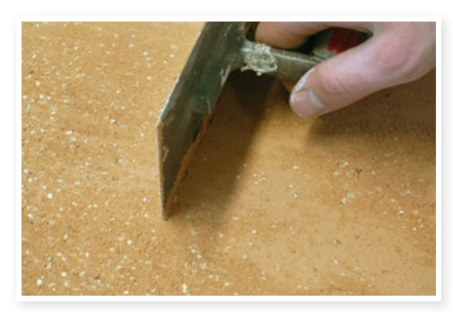
1% Vermiculite in Lime Wall Finish -fine-, tinted beige, scratching with the trowel in a 90° angle