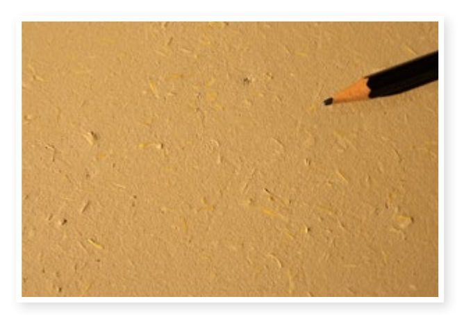
1% Barley Straw Chaff in Marble Fibre Render, tinted beige