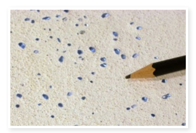
6% Glass Pebbles -light blue- in Lime Wall Finish -medium