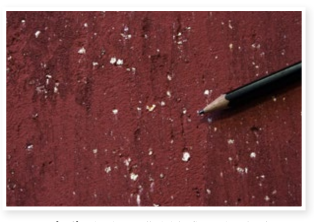
1% Vermiculite in Lime Wall Finish -fine-, tinted red