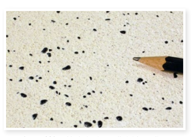
6% Glass Pebbles -black- in Lime Wall Finish -medium