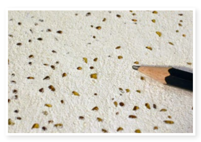
6% Glass Pebbles -amber- in Lime Wall Finish -medium