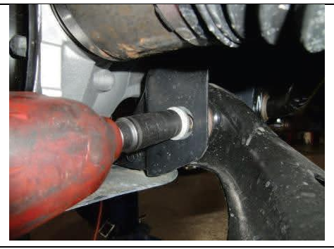
Loosen and remove rear lower control arm bolt and nut.