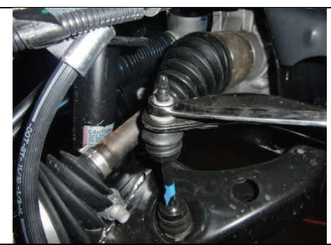
Disconnect upper sway bar end links.