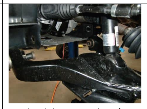
With jack, lower control arm from frame pockets.