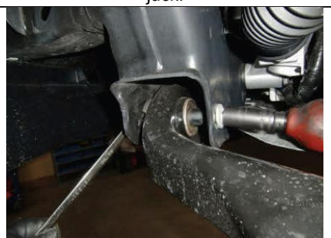
Loosen and remove front lower control arm bolt and nut