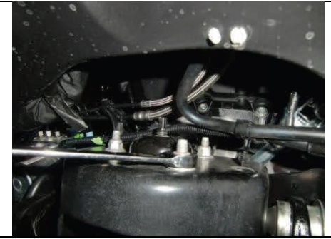
Pry ABS line clip out and remove upper strut mounting nuts.