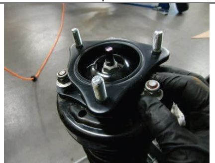
Install new strut extension with GOLD Flange Nuts, tighten.