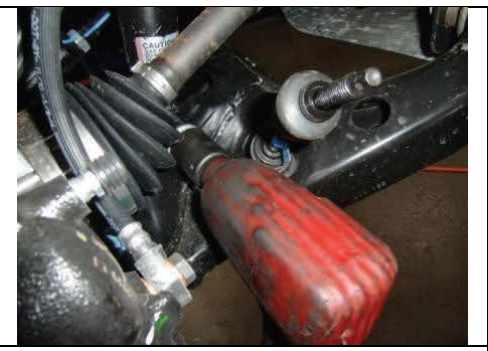
. Disconnect and remove lower shock bolt and nut.