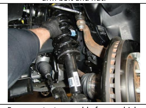
Remove strut assembly from vehicle