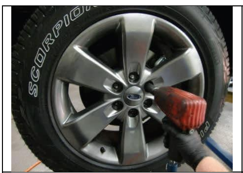
Raise and support front of vehicle off the ground. Remove front wheels/tires, support suspension with jack.