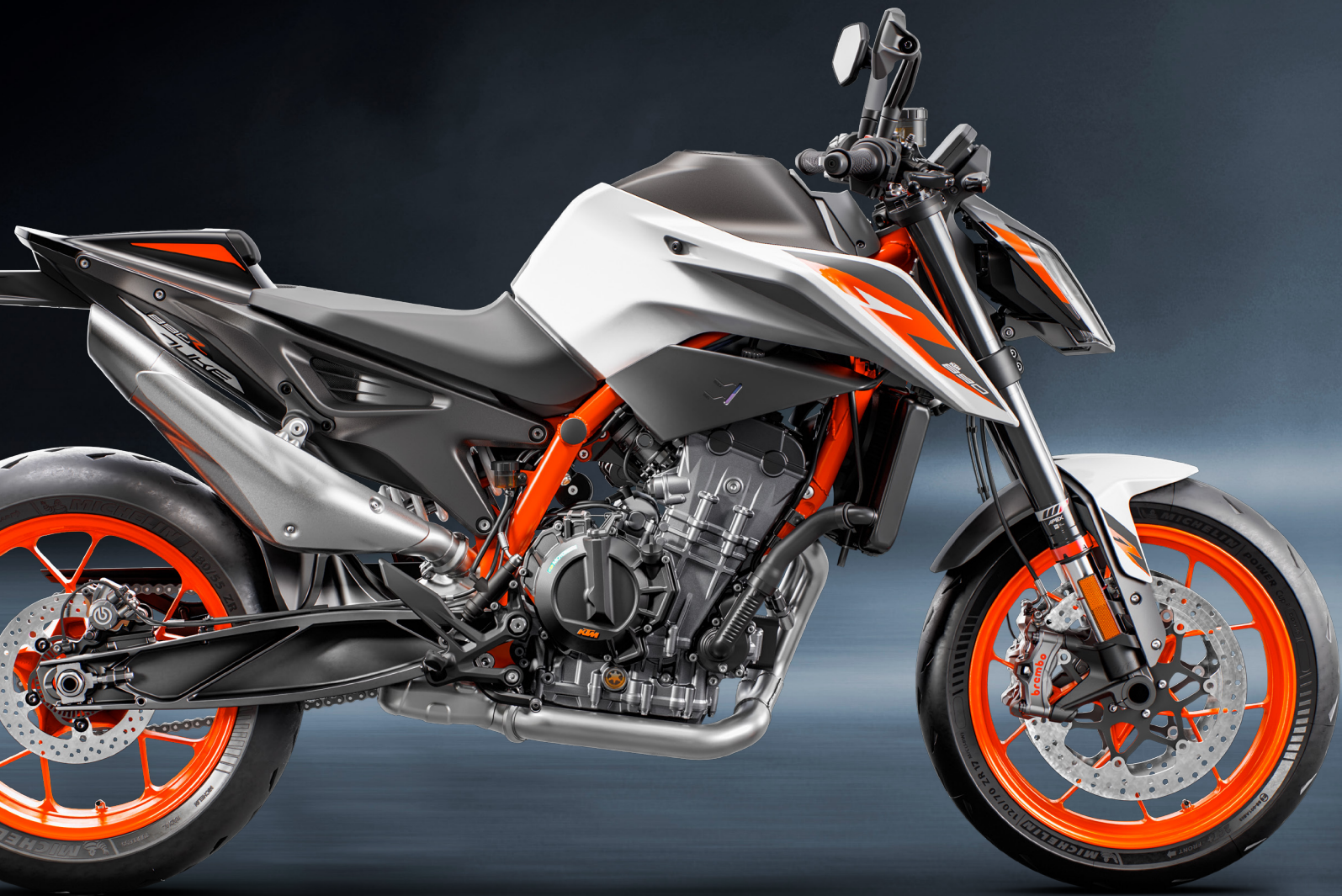
KTM 890 DUKE R